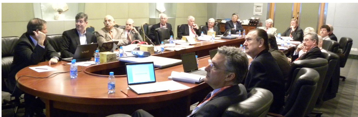
The ISR Executive Committee met during ICR 2010 in April in Shanghai, China.